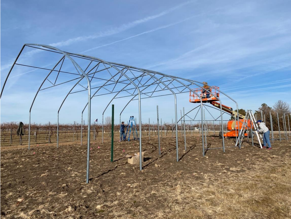
Photos of new high tunnel being constructed at Capital View Winery who is collaborating on a new specialty crop block grant evaluating the ability to grow vinifera grapevines in Nebraska.